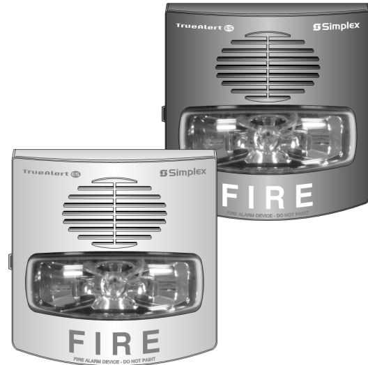
Figure 1: TrueAlert ES Addressable A/Vs are available in red with white lettering and white with red lettering