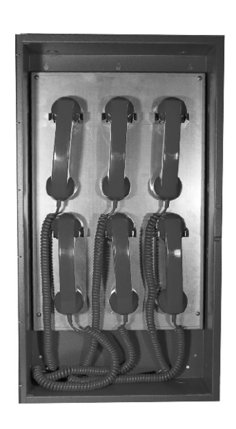
CW-MX-TC (Shown with 6 CW-MX-FH)